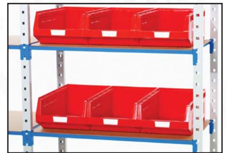
6 piece bin kit. Each bin is 310mm wide x 500mm deep x 190mm high.