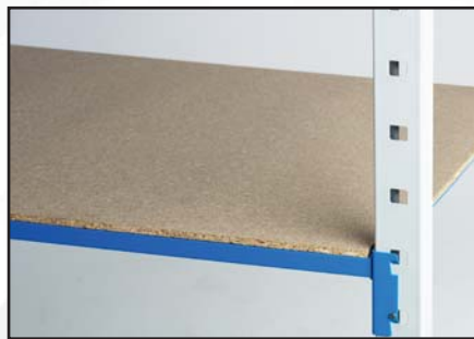
8mm thick chipboard shelf covers.