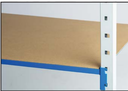
3mm thick hardboard shelf covers.