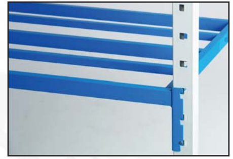
Heavy duty tubular shelf. U.D.L. capacity 500kg. Supplied with retaining pins.